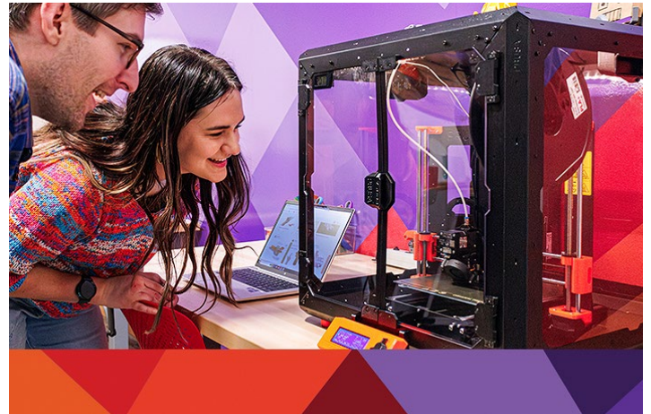
Create Space Lab: Mystery Maker