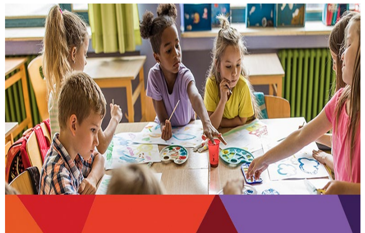
Kids Club: Sink or Float Activities