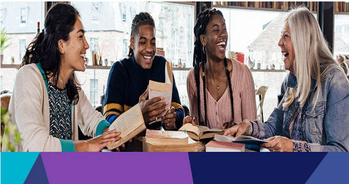
Fiction Readers Book Group at Deer Creek: The Golden Spoon