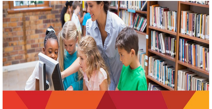
Librarian in Training