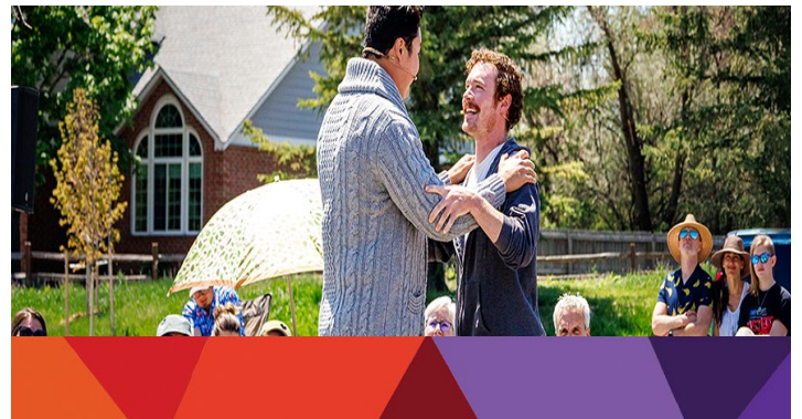
Shakespeare in the Parking Lot: A Midsummer Night's Dream