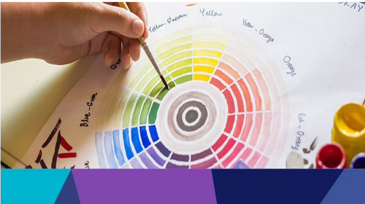
Landscape & Color Theory Class