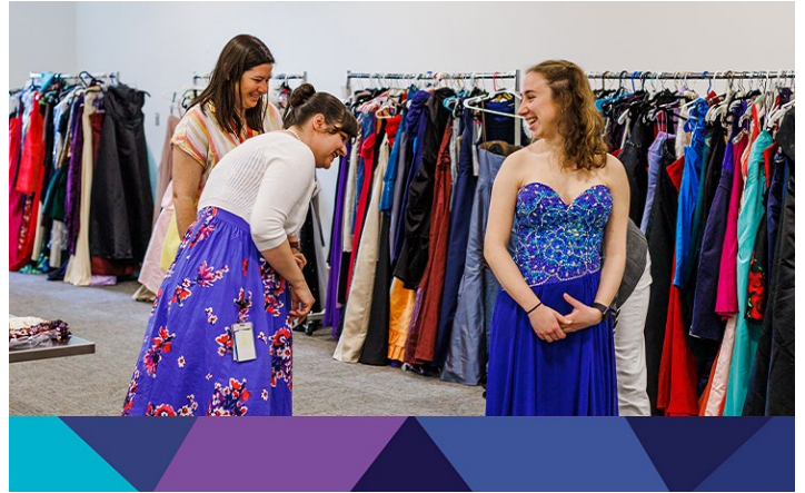
Prom Swap Festival