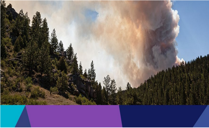
Wildland Fire Management Program presented by JCSO at Deer Creek