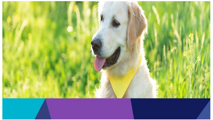
Learn to Sew: Pet Bandanas