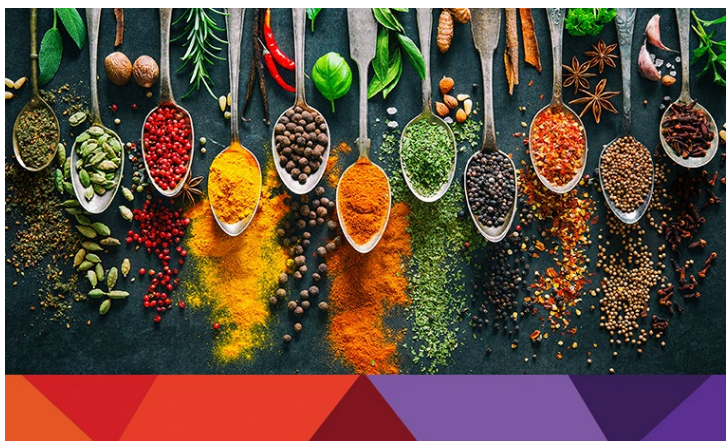
Spice of the Month