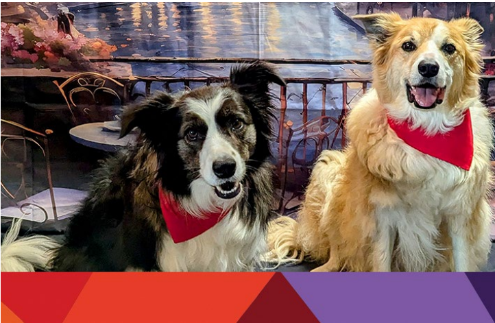
Art Theft: A Dog Comedy starring Joey & Kira