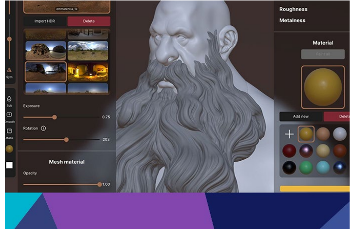
Intro to Nomad Sculpt: Digital Sculpting Fundamentals