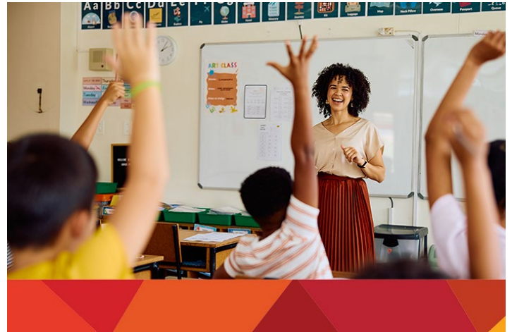
Educator Open House: DTLs & Teachers