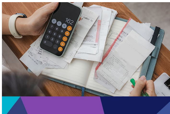
Could Budgeting Be Your Superpower?