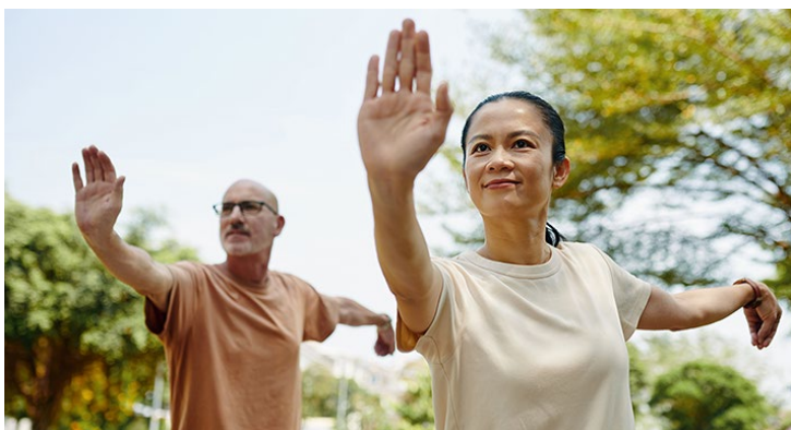
Tai Chi for Arthritis and Fall Prevention